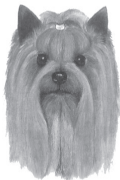
Japan Kennel Club

Ears: Small V-shaped, and carried erect or semi-erect, and not far apart, covered with short hair, colour to be of a very deep rich tan.