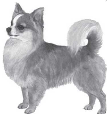
Japan Kennel Club

A breed standard is the guideline which describes the ideal characteristics, temperament, and appearance of a breed and ensures that the breed is fit for function with soundness essential. Breeders and judges should at all times be careful to avoid obvious conditions and exaggerations, as well as being mindful of features which could be detrimental in any way to the health, welfare or soundness of this breed.