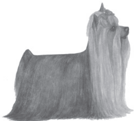
Japan Kennel Club

A breed standard is the guideline which describes the ideal characteristics, temperament, and appearance of a breed and ensures that the breed is fit for function with soundness essential. Breeders and judges should at all times be careful to avoid obvious conditions and exaggerations, as well as being mindful of features which could be detrimental in any way to the health, welfare or soundness of this breed.