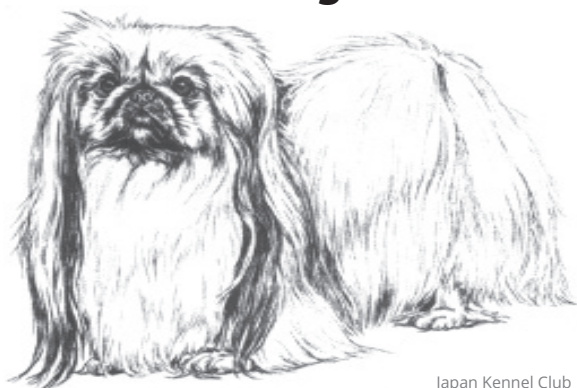
Japan Kennel Club

A breed standard is the guideline which describes the ideal characteristics, temperament, and appearance of a breed and ensures that the breed is fit for function with soundness essential. Breeders and judges should at all times be careful to avoid obvious conditions and exaggerations, as well as being mindful of features which could be detrimental in any way to the health, welfare or soundness of this breed.